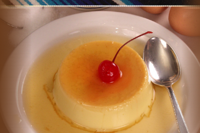
Flan = 250